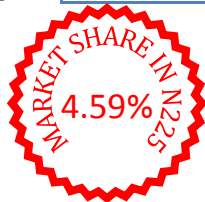
Historical Average Daily Traded Value and Market Share in N225